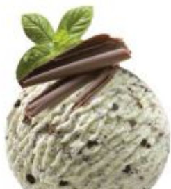
5 MINT CHOCOLATE

A smooth and creamy white chocolate ice cream with rasps of white chocolate.