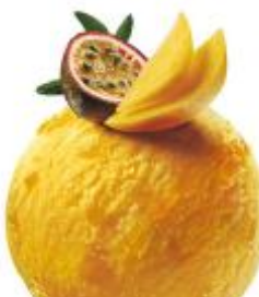
6 PASSION FRUIT & MANGO

Refreshing mint ice cream and crunchy pieces of Swiss chocolate: an irresistible creation.