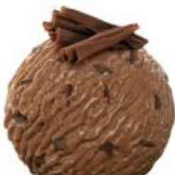
3 SWISS CHOCOLATE

A creamy, fruity and refreshing ice cream embellished with delectable strawberry pieces.