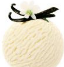
1 VANILLA DREAM

Indulge in the luxurious and natural taste of Swiss perfection.