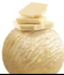
4 WHITE CHOCOLATE

Premium Swiss chocolate shavings blended in a creamy ice cream. The true taste treat for chocolate lovers.